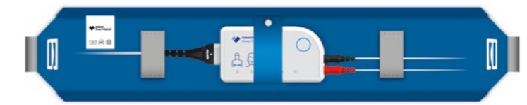
Belt with built-in ECG electrodes and respiratory stress sensor