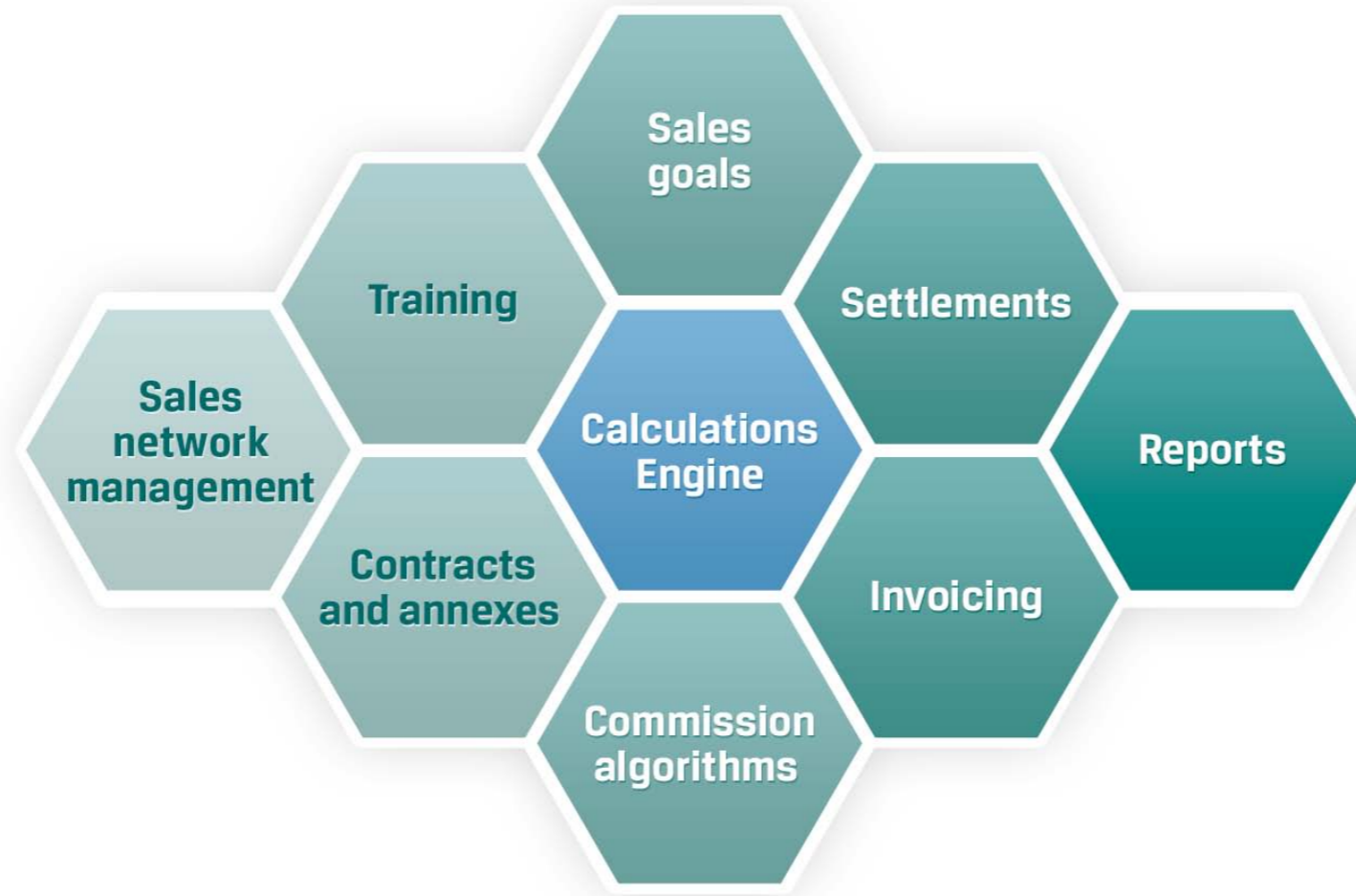
Comarch Commission & Incentive system functional schema

An accepted invoice is immediately decreed in the accounting system. At the same time the agent accepts the invoice from the system. It can be printed, signed and sent back to the financial institution or digital signature can be used by the agent. A transfer order is sent to the system responsible for the realization of transfers. An automatically received confirmation of the transfer completion allows for the immediate agreement of payments with invoices and the closing of the account.