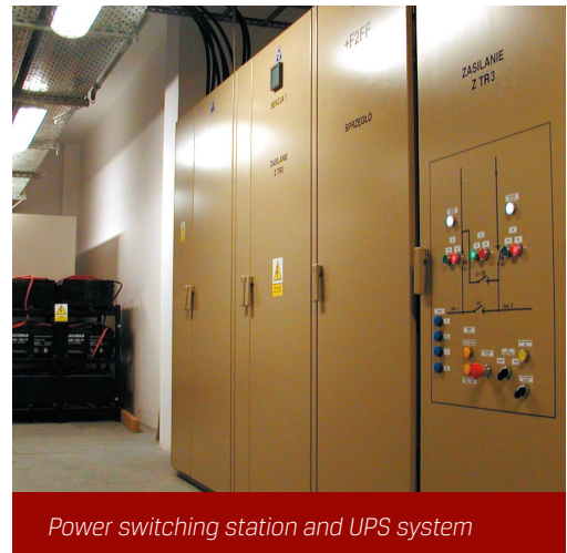
Power switching station and UPS system

Comarch Data Center can also accommodate a client's growing volume of data by increasing the size of the system's mass memory.