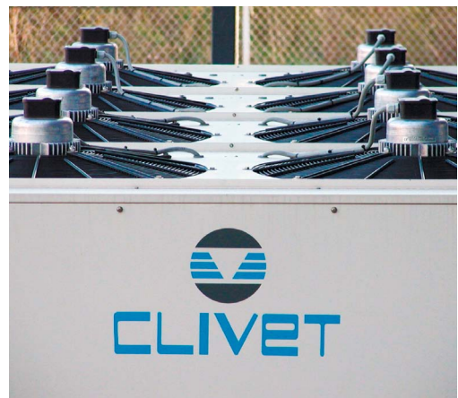
Air conditioning system